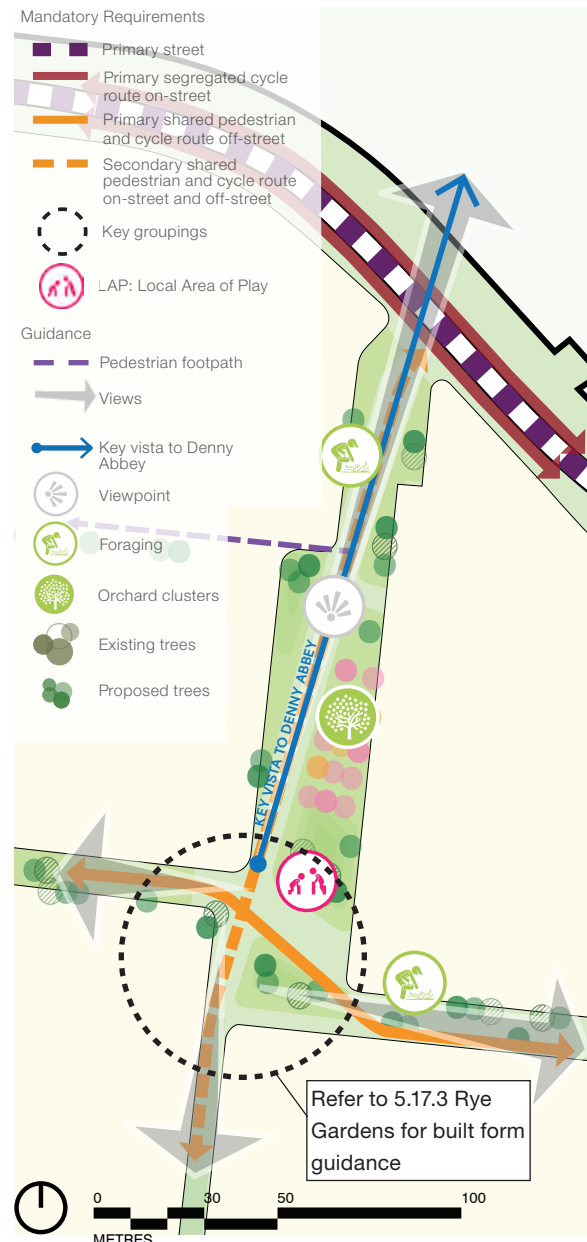
Figure 4.92: Indicative landscape proposals - Rye Gardens