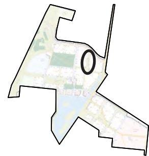
Figure 4.90: Location in KP1 in accordance with the Regulatory Plan