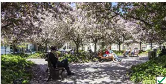
Figure 4.91: Good example of a formalised space characterised by orchard trees and landforms