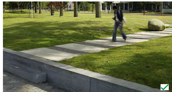
Figure 4.88: Example of a formal lawn with parkland trees and a change in level to denote a threshold.

and water treatment and must be vegetated for biodiversity value