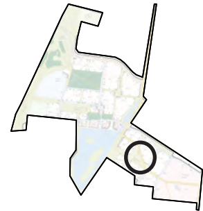
Figure 4.87 Location in KP1 in accordance with the Regulatory Plan

Causeway Park provides an open green urban parkland associated with the Causeway route functioning as a transitional green space from the naturalistic lakeside to the more urban Principal Centre. The design of this space will be informed by the Urban Parkland planting characteristics. See Section 5.6 Frontage character for guidance on the built form interface.